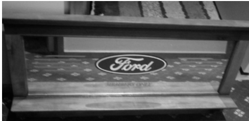
Ford Mirror with Shelf